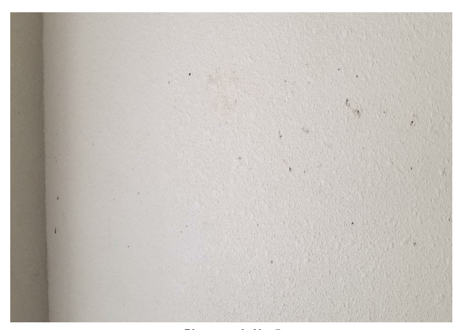
<u>Photograph No. 5</u> HA-11: Interior wall texture