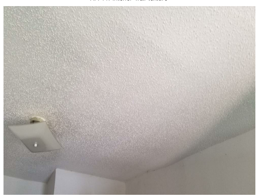
<u>Photograph No. 6</u> HA-12: White Interior Ceiling texture