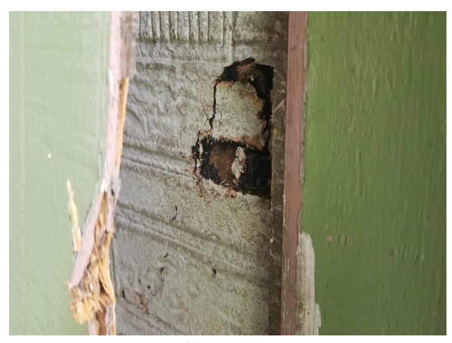
<u>Photograph No. 3</u> HA-03: Red Vinyl sheeting, Orange adhesive