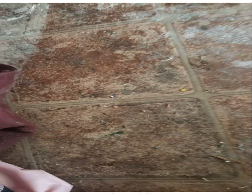
Photograph No. 2 HA-02: Maroon Carpet and Grey floor padding