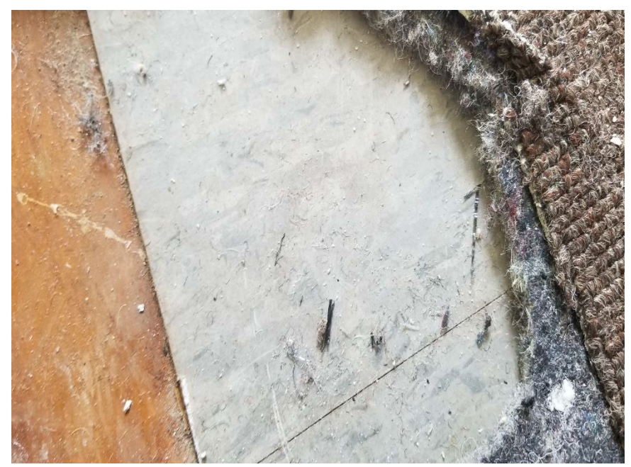
Photograph No. 1 HA-01: 12" x 12" Grey/Blue speckled vinyl tile, and Orange adhesive