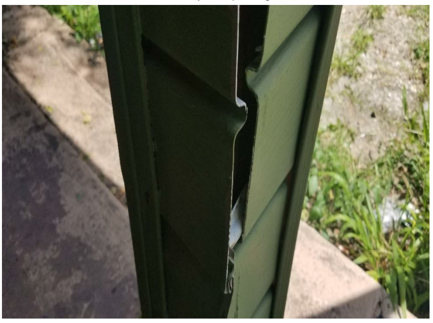
<u>Photograph No. 4</u> HA-04:Faux wood vinyl sheeting, Yellow Adhesive